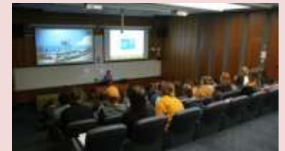
Photo: Newcastle screening of the Crash Reel